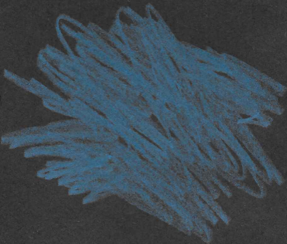
Irregular Galaxy (Newer)