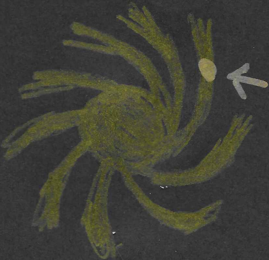
Spiral Galaxy (Middle-Age Stars)